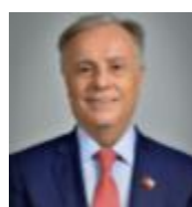
Emilio Santelices Cuevas, MD Minister of Health Presidency of the Government of Chile