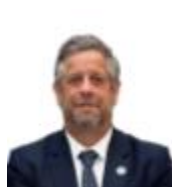
Adolfo Rubinstein, MD National Secretary of Government for Health Presidency of the Government of Argentina