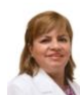
Elizabeth Z. Tomas, MD Minister of Health Presidency of the Government of Peru