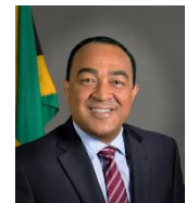
Christopher Tufton, MD Minister of Health Presidency of the Government of Jamaica

12:00 – 1:00 pm NETWORKING LUNCH – Sponsored by Schoen Clinic