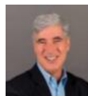
Juan Pablo Uribe, MD Minister of Health Presidency of the Government of Colombia